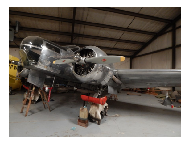
The Monte Vista, CO, AT-11 restored and flying.