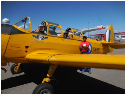
Young EAA Eagles