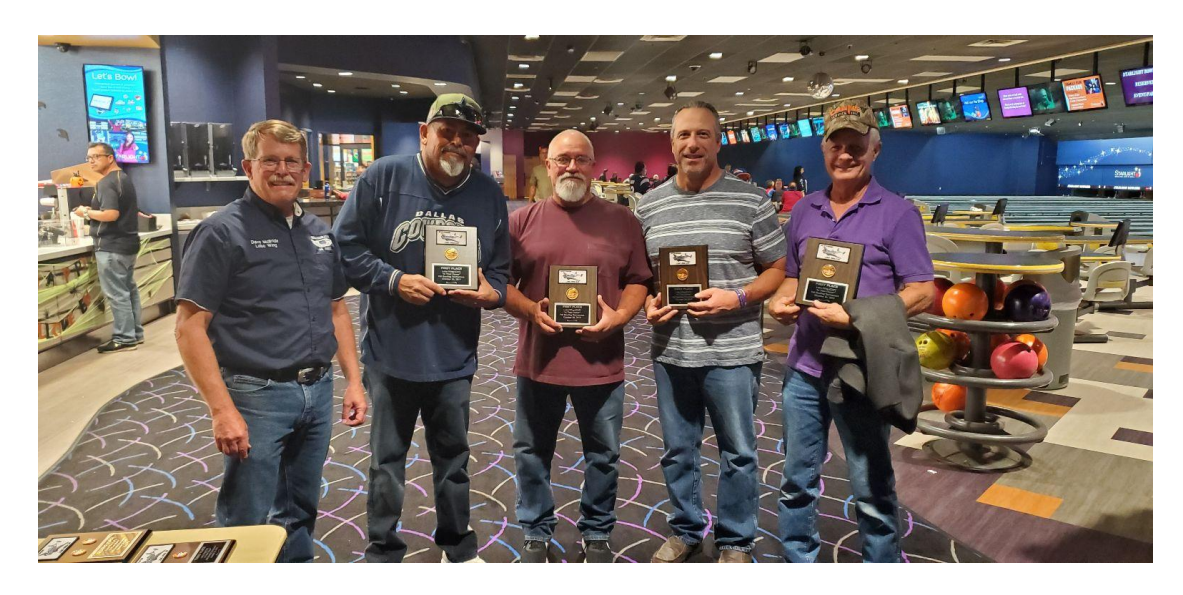
First Place Bowling Team "La Familia"