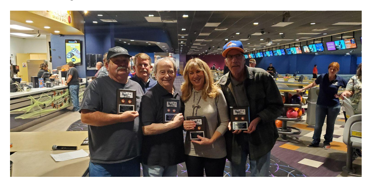
Second Place Bowling Team "Vickis Team"