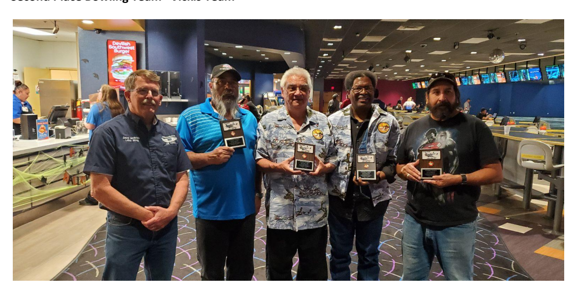
Third Place Bowling Team "Lobo Wing"